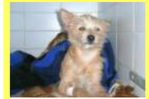
527 "adozione strada"*

FREE OF CHARGE: - 100 strays - 21 owned dogs - 66 LPA dogs