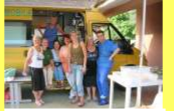
10 dogs during a "spay tour" to Ladispoli

For "only" 253 owned dogs did the owners pay for the surgery.